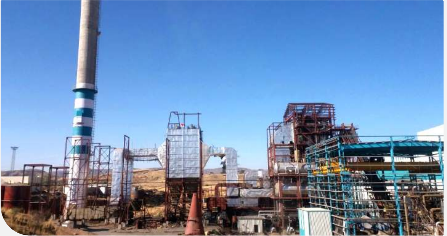
Sharayu Agro Industries Ltd. 160 TPH, 87 Bar, 520°C