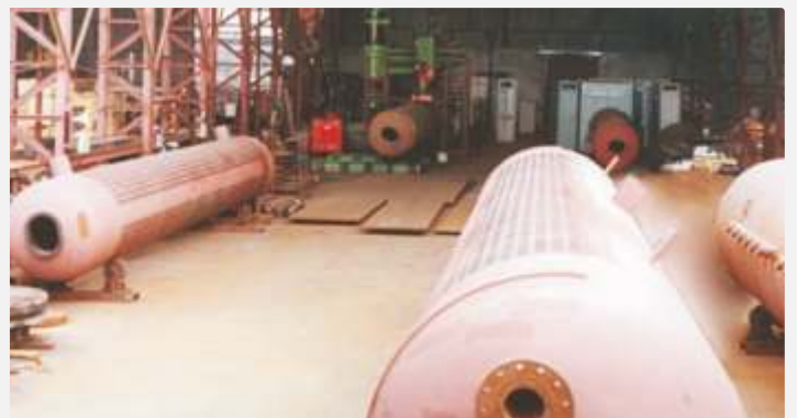
Boiler manufacturing shop