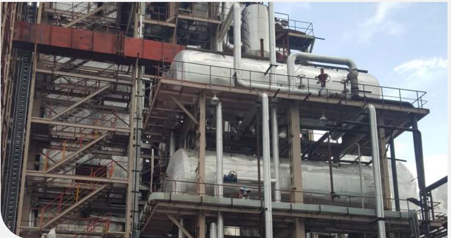
Vitthalrao Shinde SSK. 150 TPH, 87 Bar, 520°C