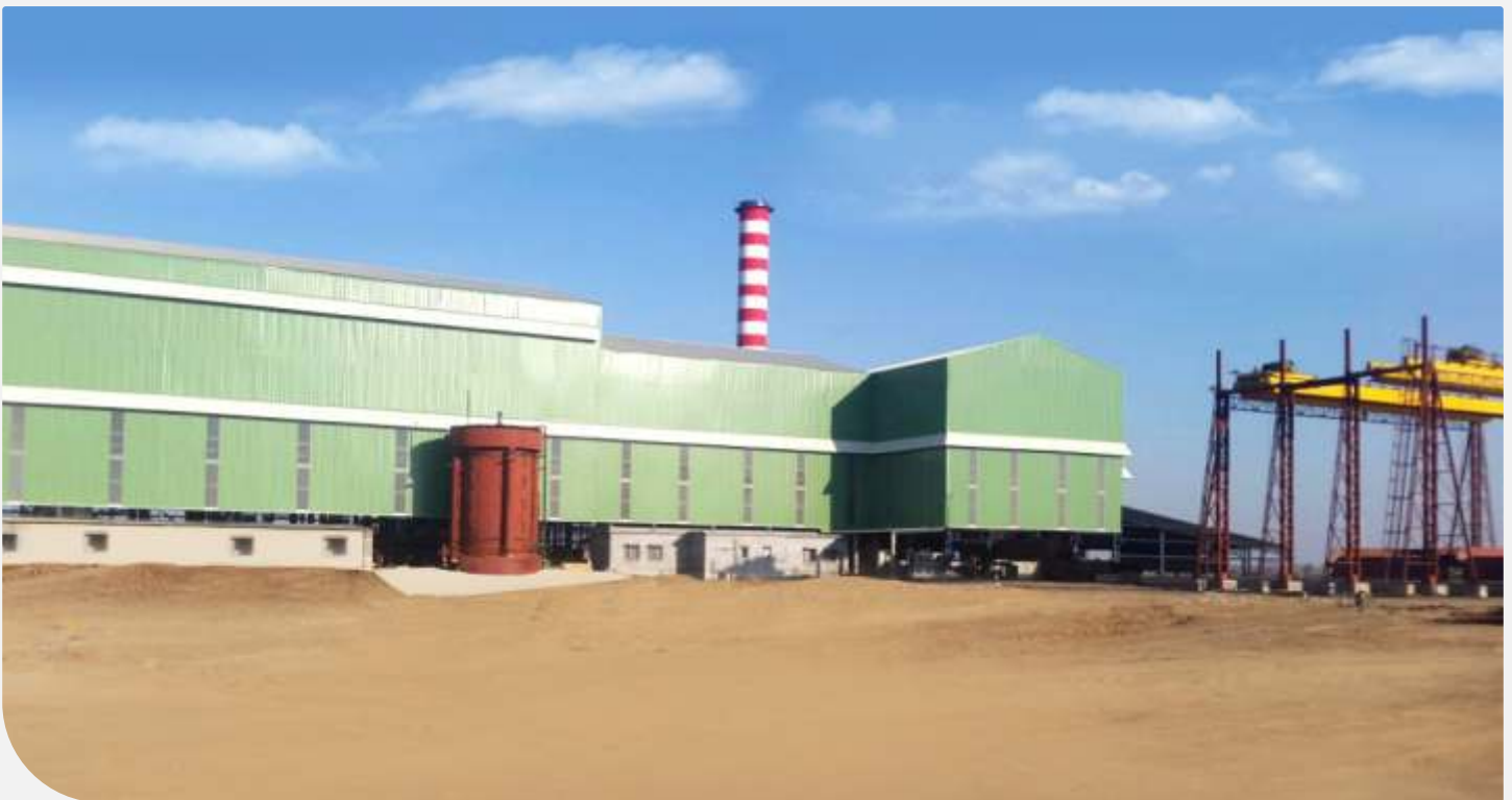
Kancheshwar Sugar Ltd. 2500 TCD With 80 TPH, 87 Bar, 520 o c Boiler. 14 MW Co - Generation.