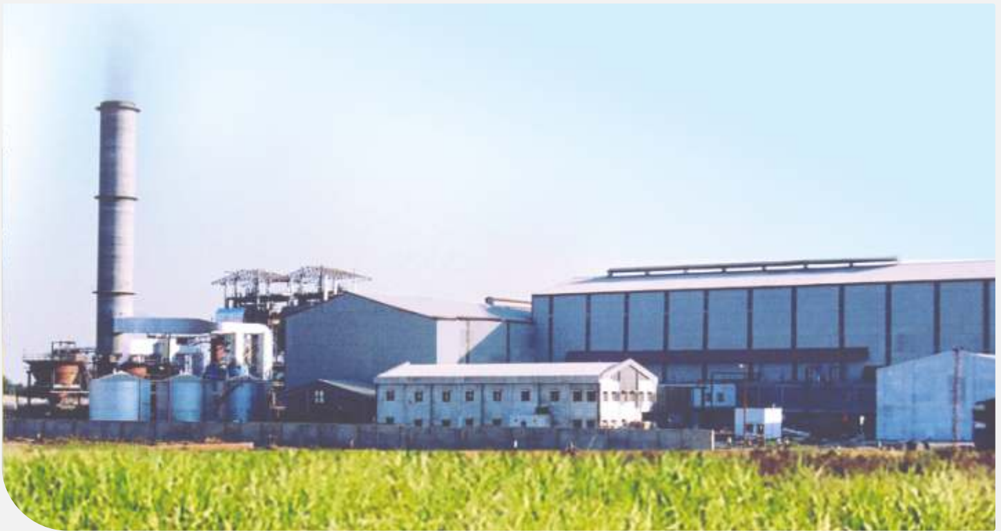
Bajaj Hindustan Ltd., BILAI Unit 9000 TCD With 90 TPH, 20 MW Co - Generation.