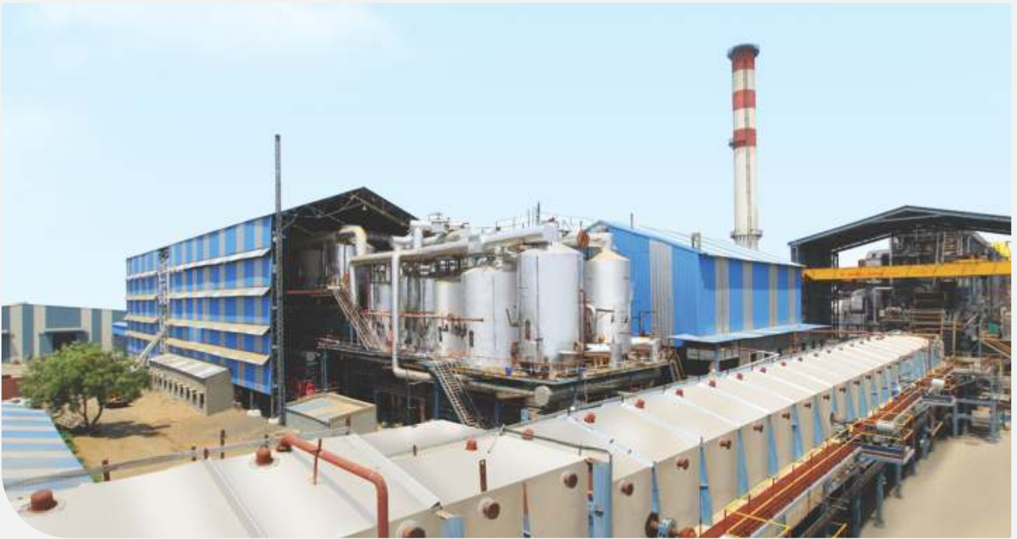
Indian Sugar Manufacturing Company Ltd. 4500 TCD With Diffuser - 20 MW Co - Generation.