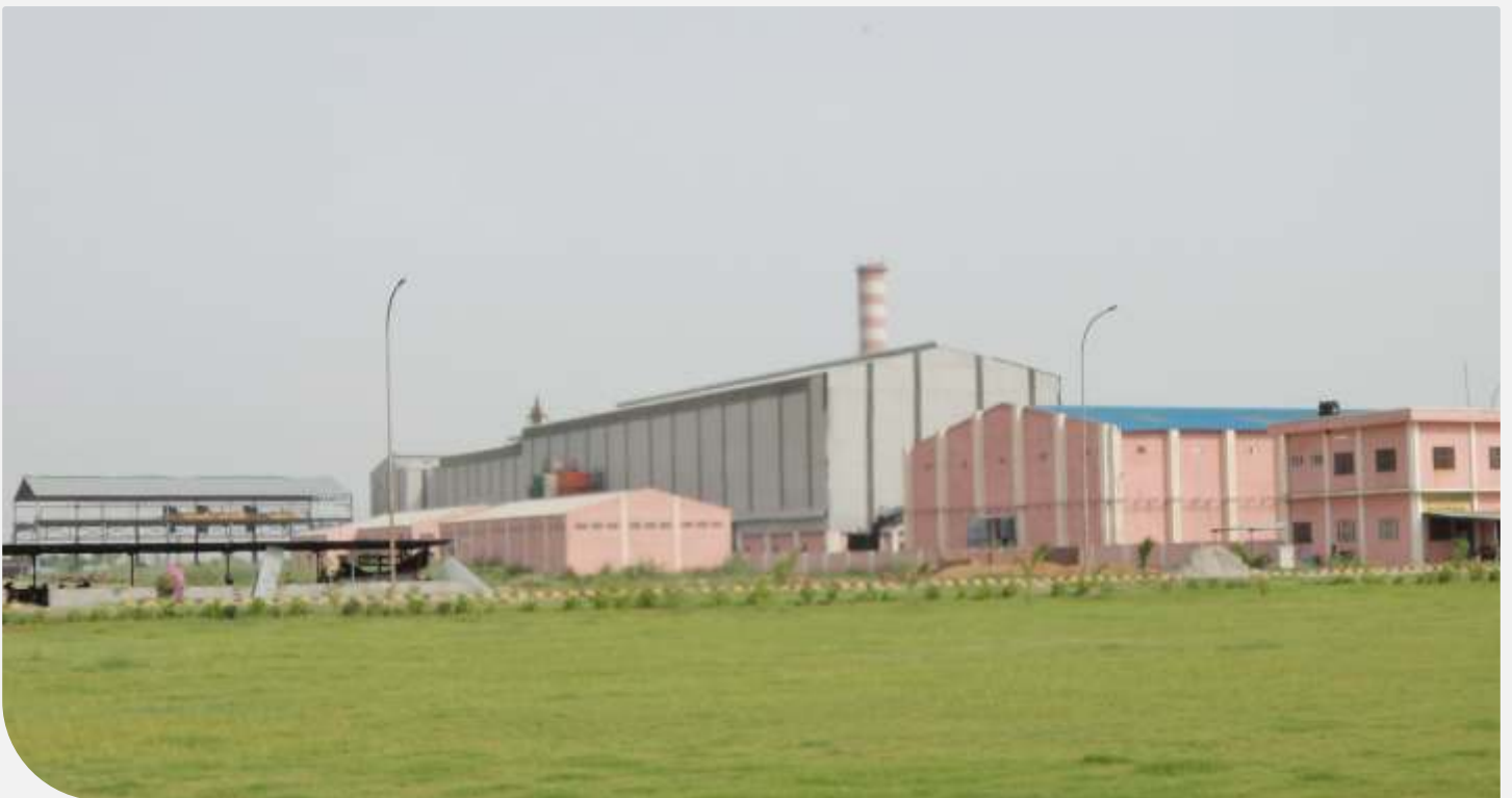
Rohtak Co-operative Sugar Mills Limited 3500 TCD With 16 MW Co Generation