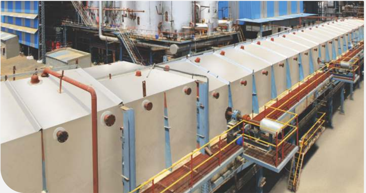
Indian Sugar Manufacturing Company Ltd.