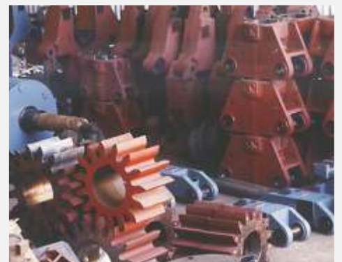
Mill Parts ready for Dispatch