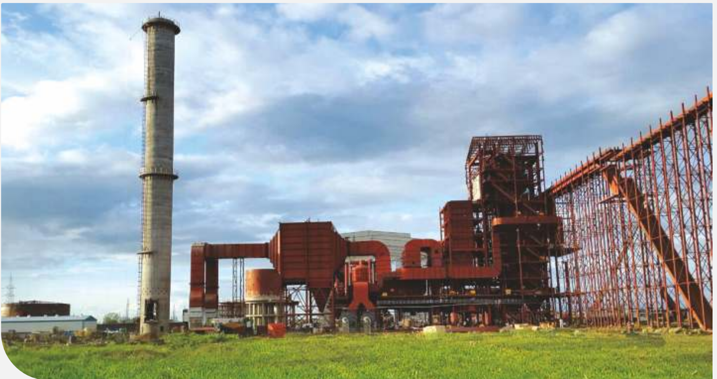
Babanraoji Shinde Sugar & Allied Industries