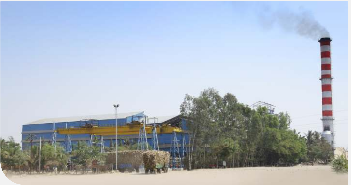
Siddhanath Sugar Mills Limited 6000 TCD 26 MW Co - Generation.