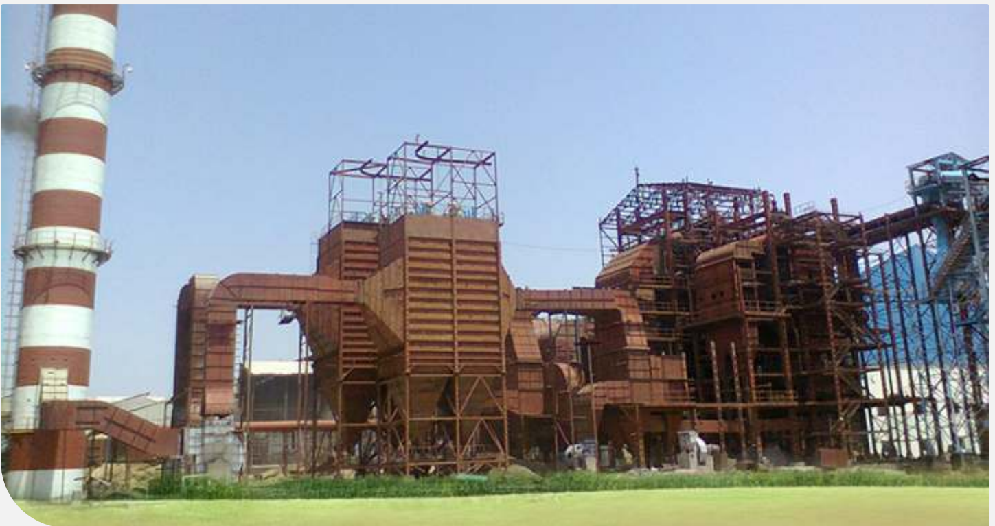
Vaidyanath SSK Ltd. 70 TPH, 87 Bar, 515°C 40 TPH, 87 Bar, 515°C