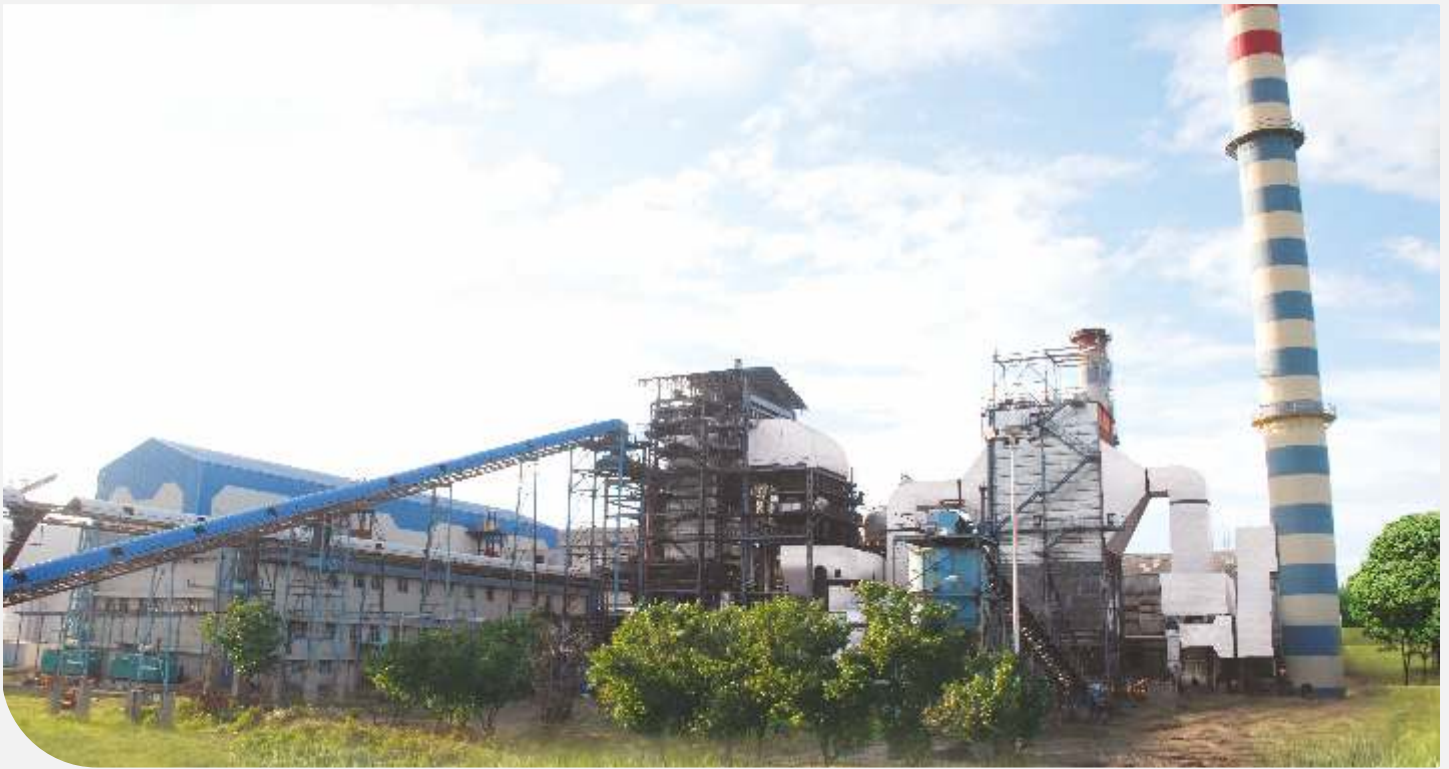
Sonhira SSK Ltd. 115 TPH, 87 Bar, 515°C