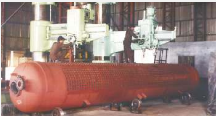
Boiler drum drilling