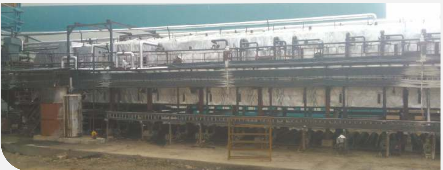
Sharayu Agro Industries Ltd.