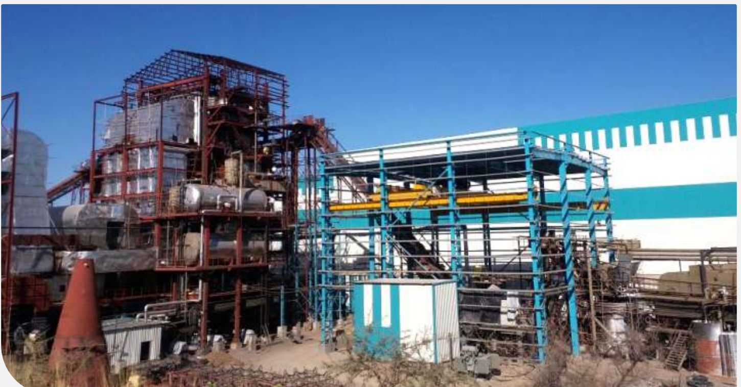
Sharayu Agro Industries Ltd. 6000 TCD With 160 TPH, 87 Bar, 520°C Boiler. 33 MW Co - Generation.