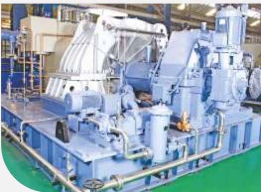
Turbo Generating Set