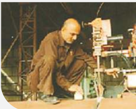
Drum shell Welding on SAW Machine