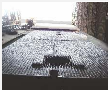
Furnace Panel Assembly